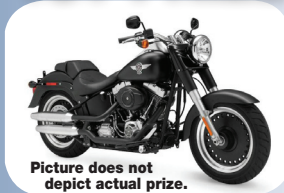
Picture does not depict actual prize.

Color: Vivid Black, Factory SecuritySystem, 96 Cubic-inch Motor, Satin Chrome Mufflers, Internally Wired Handlebars, 6-speed Transmission, Low Suspension 24.3 Seat Height.